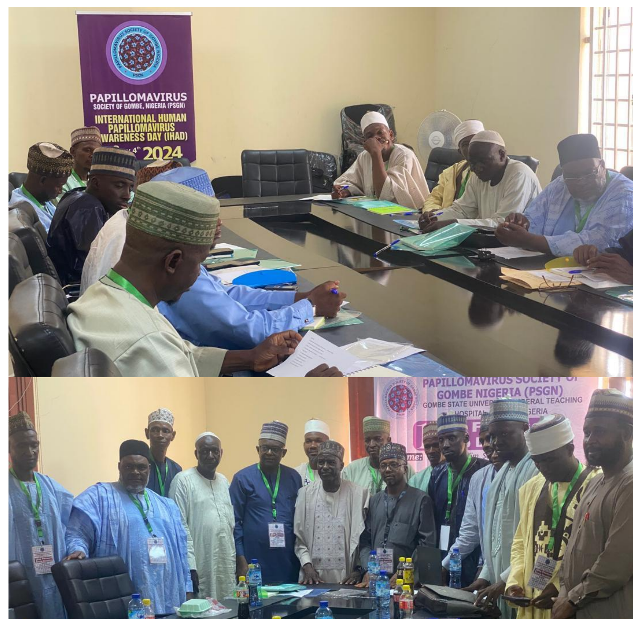
Cross section of the participants during and after the FGD